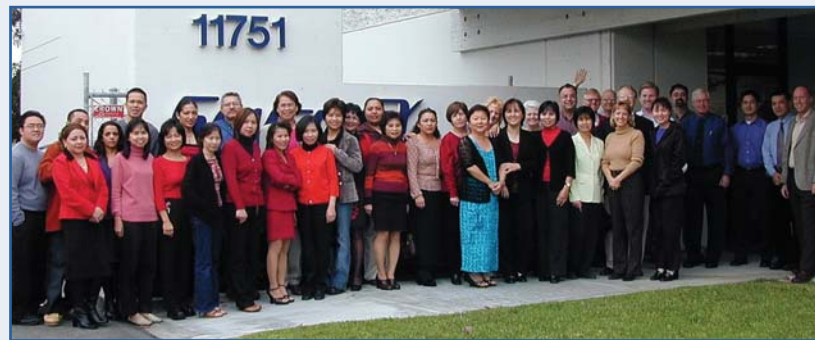
With over 37 years serving industry, Sensorex provides knowledge and experience you can depend on.

With more than 37 years of experience, Sensorex is a recognized leader in high quality electrode manufacturing for industry. We offer pH, ORP (REDOX), Conductivity, Resistivity, Dissolved Oxygen and other specialty electrodes for a wide range of applications. Our sensing solutions are designed to solve problems and enhance measurement performance. For detailed specifications and data-sheets on any of our products, please visit our website at: http://www.sensorex.com .