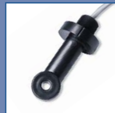
Toroidal Conductivity Sensors