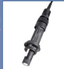
Self Cleaning Flat Surface pH and ORP Electrodes

Sensorex manufactures a complete line of laboratory electrodes for pH, ORP, Conductivity and Dissolved Oxygen. Request a copy of our laboratory electrodes catalog or visit our web site at http://www.sensorex.com .