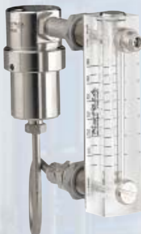
Model L with constant flow regulator model 2850