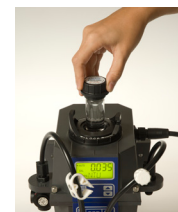
*figure 2 Easy Calibration